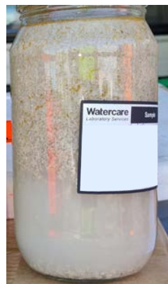
Site2: 15 Sep 2022