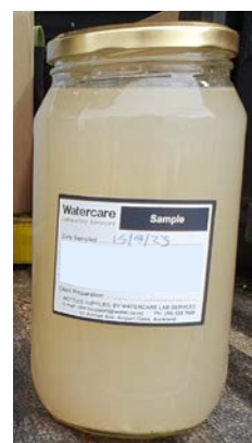
Site1: 16 Sep 2023