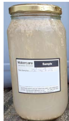
Site2: 16 Sep 2023