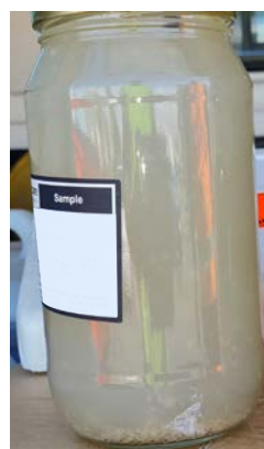
Site1: 15 Sep 2022